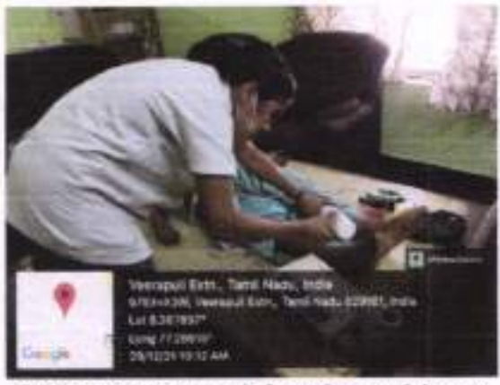
ECG assessment carried out for participants