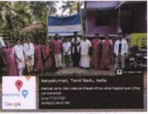
Medical team along with IFSD Volunteers