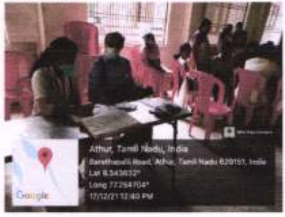
(a) Medical Consultation (b) Medical Consultation on Medical camp on Gastrointestinal Diseases conducted on 17/12/21 at Athur, Thiruvattar block