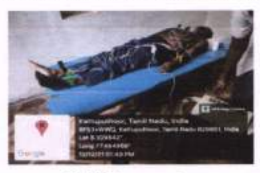
(a) Blood Glucose Assessment on Cardiology awareness, Screening and Medical camp conducted on 12/12/21 at Kattuputhur, Azhagiapandipuram.