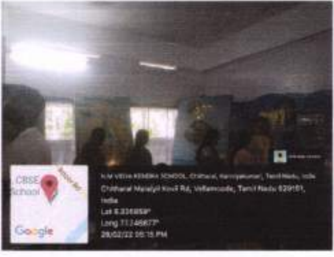
Visuals from the Exhibition Stalls