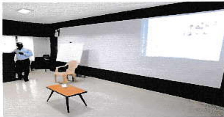
Workshop on "application of statistics using SPSS in research"