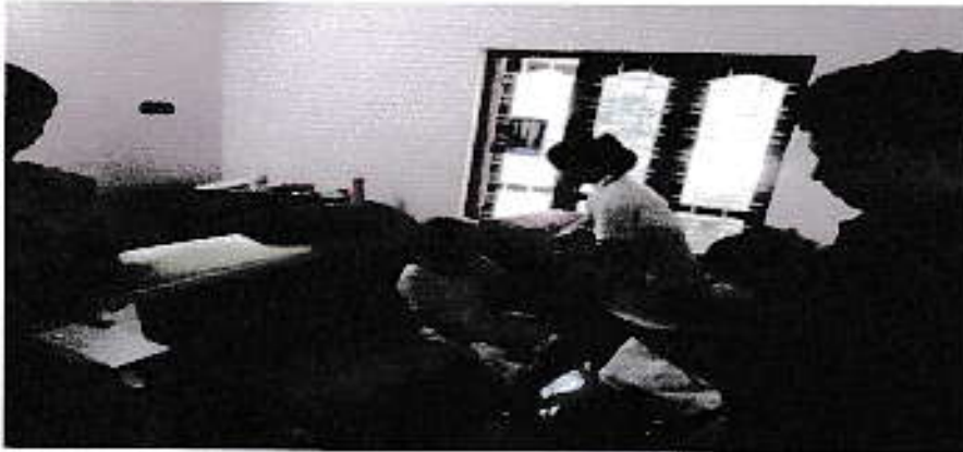
Community Based Learning – House visit: