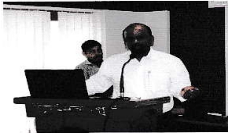
Workshop on "application of statistics using SPSS in research"