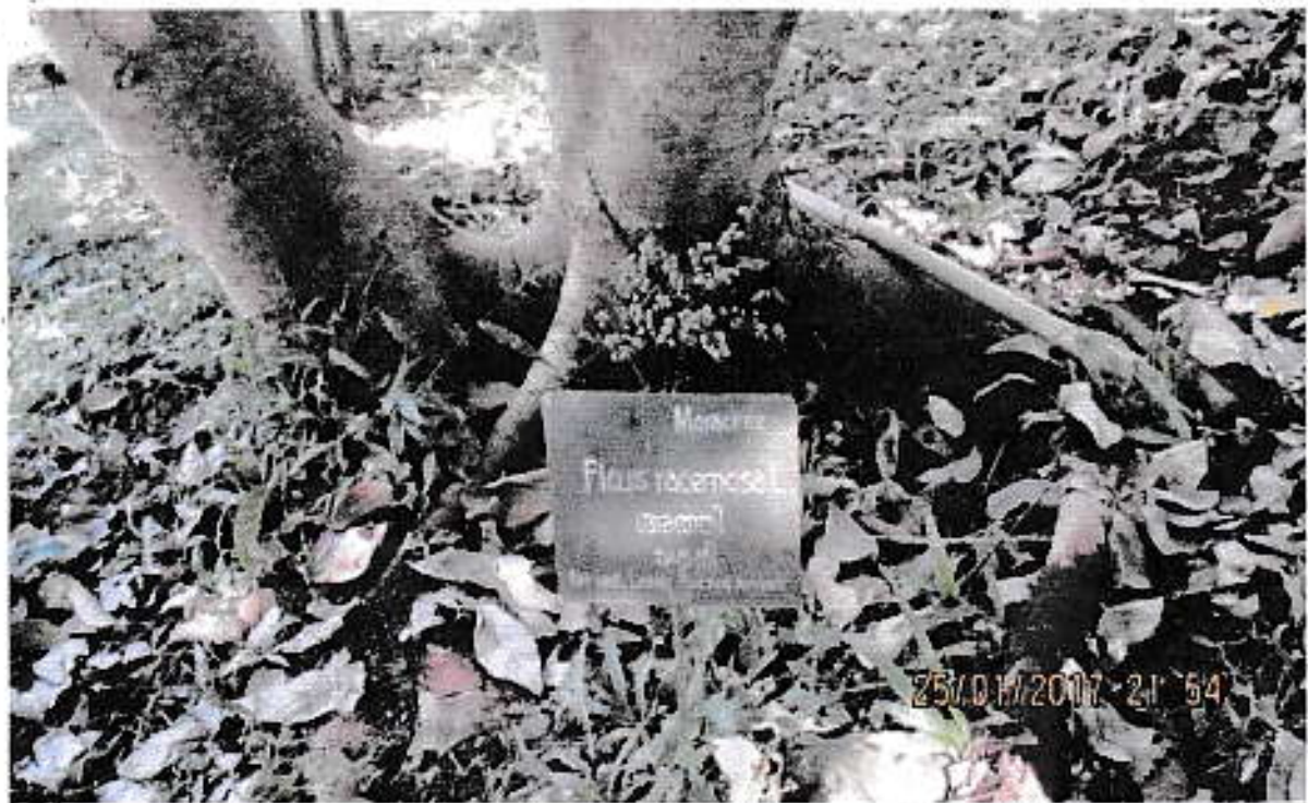
Fig tree in the campus